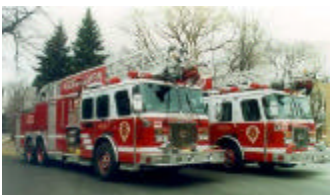
Complete exercise for Engine, Truck and Squad Assignments

Describe what each persons tool assignment is for any of the above incident types.