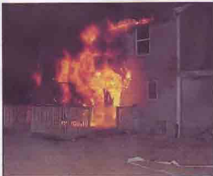
Review Pump and Apparatus Positioning "Methods of Structural Fire Attack"

What are your incident priorities at this fire? What must you identify in your 360° size-up? What crew safety considerations must be observed?